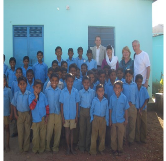
The hostel in 2012