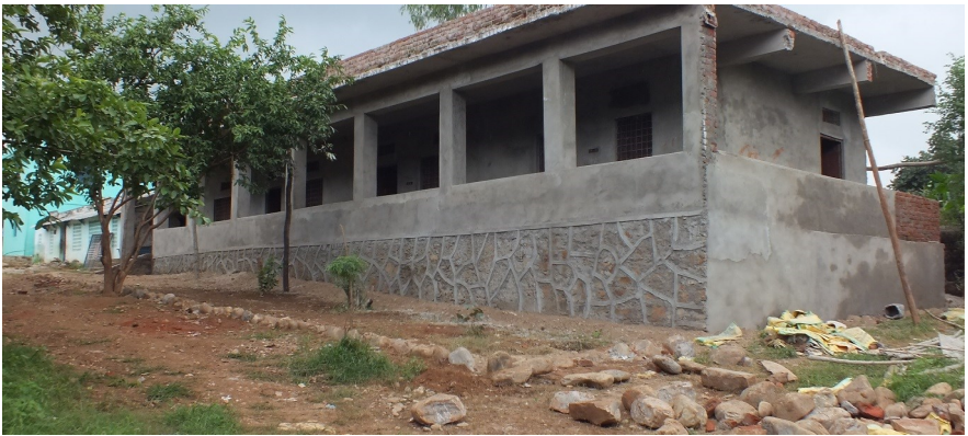
New Accommodation Block